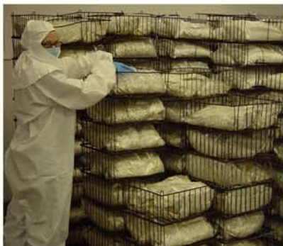
7. Growing in Sterile environment