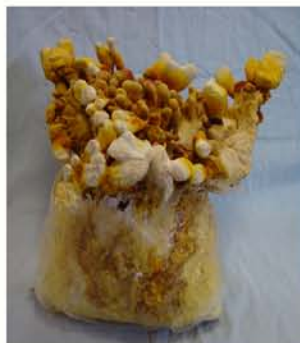
8. Ready to harvest