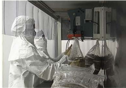
5. All work done in sterile air hoods