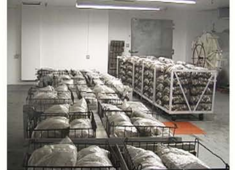
3. Sterilized substrate cooling in sterile air