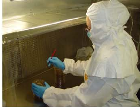
2. Transferring culture to inoculum