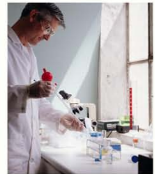
9. Quality control and further processing

Further processing can take many forms, and depends on the customer’s requirements. What can we make for you?