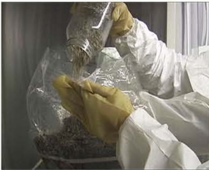
4. Inoculating substrate