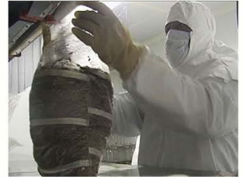
6. Hermetically sealing grow bags